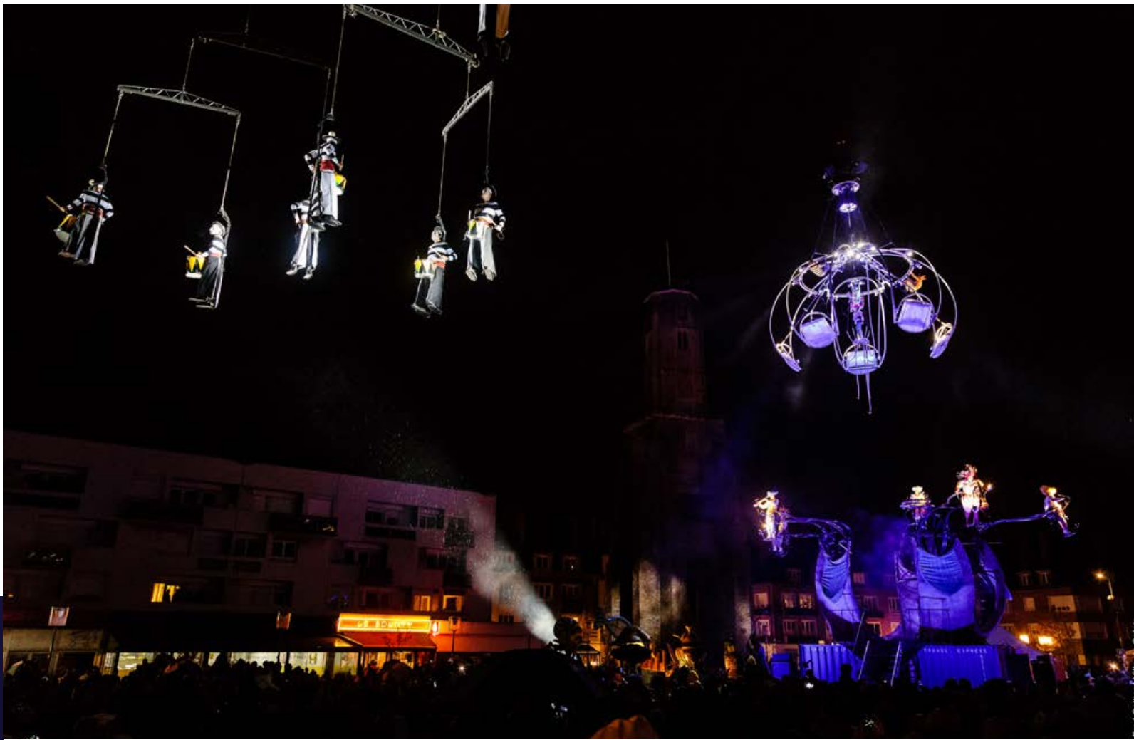
Aerial format XXL

We can propose parades with one or several floats, creating magical, ingenious or exuberant scenes pulling the public into their wake.