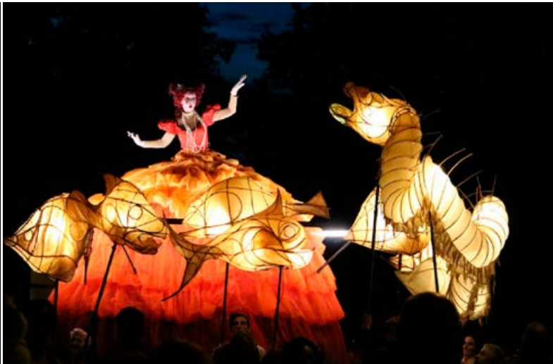
A giant doll meets one of the fish from the Mù parade