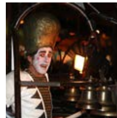
The accelerator of time _Alto bell