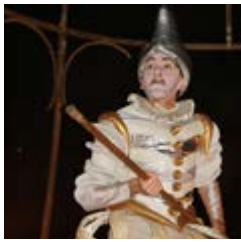
The bell ringer of beyond _bass bell