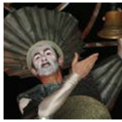
The watcher_Tenor bell