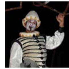
The waiter _Percussionist