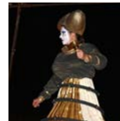
The time catcher _Soprano bell