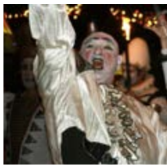
The bussaneer_Bass bell